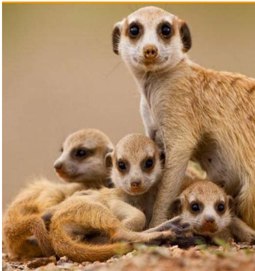
Cute Meerkat family