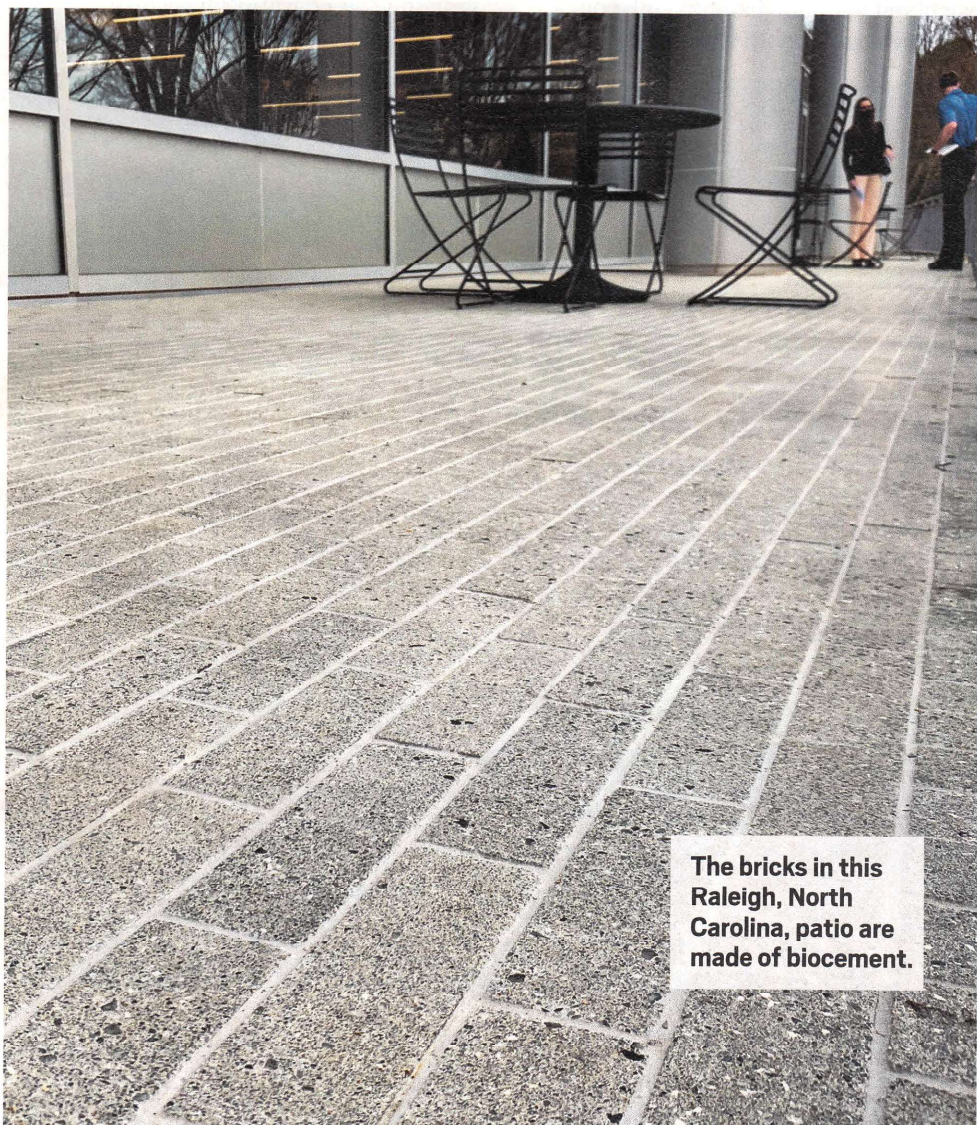
The bricks in this Raleigh, North Carolina, patio are made of biocement.