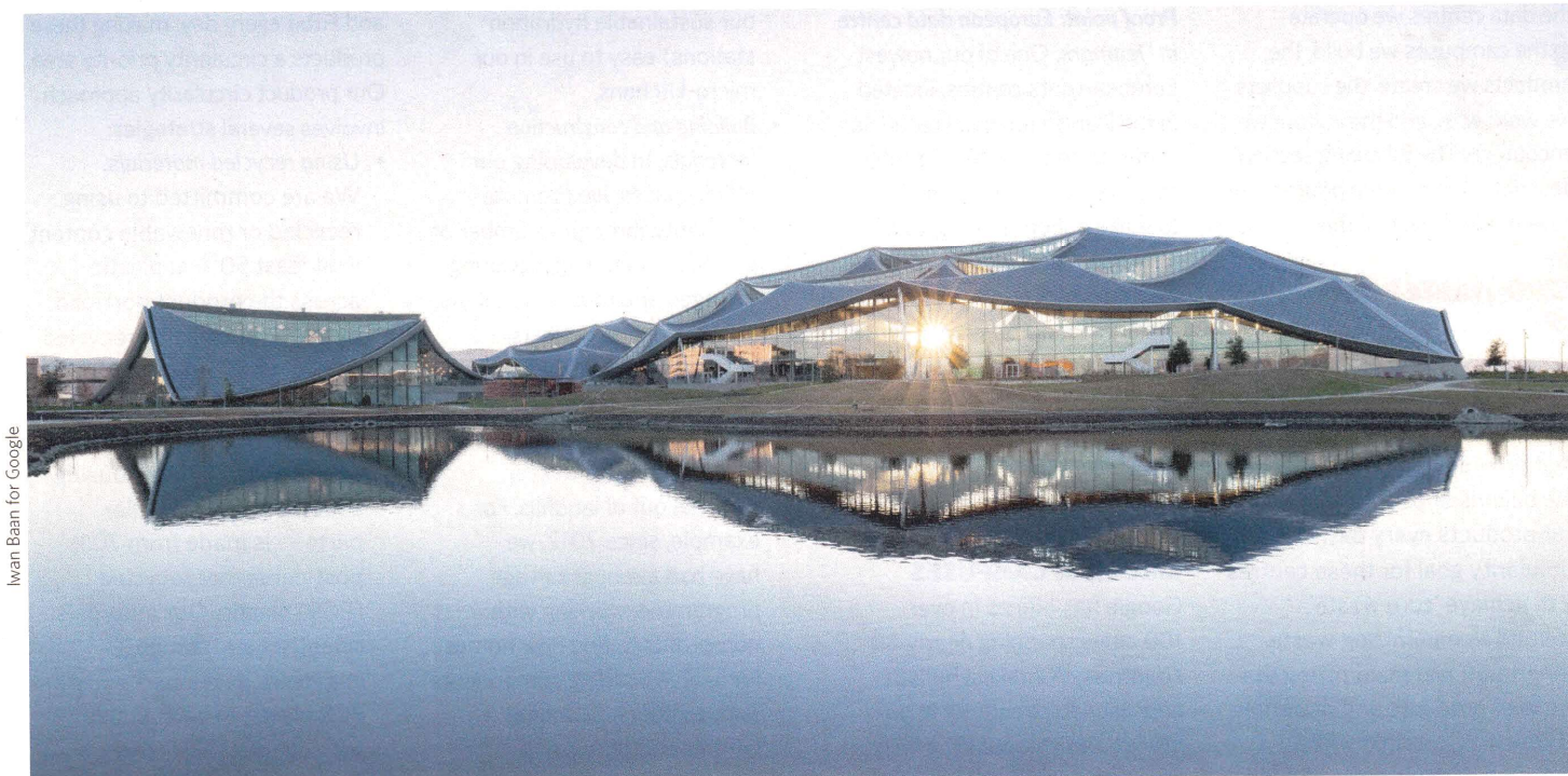
Iwan Baan for Google