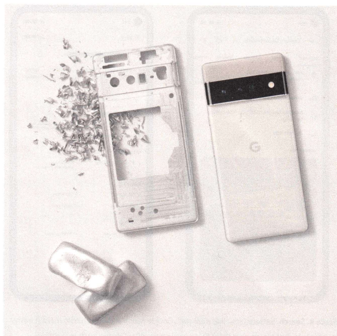
Figure 3. Recycled aluminium in hardware. Google developed a 100% recycled aluminium alloy, validated by a third-party certifier, to improve circularity in the Pixel phone.

spaces that can change without needing extensive renovations, design for disassembly to avoid demolition waste, and create a deconstruction plan from the start. Regulation has an important role to play in supporting these practices.